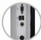
DICOM 3.0 (optional),USB