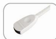
5.0 MHz Micro-Convex MCSV-A