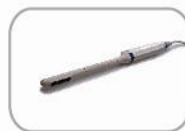
7.5 MHz Transrectal R7-A