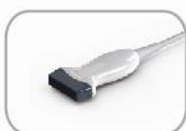
5.3-10.0MHz Linear L7M-A