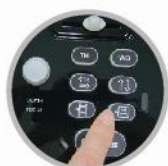
One- key quick save