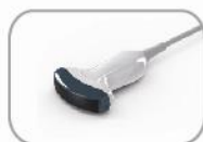
3.5MHz Convex C3-A