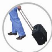
Carry bag (BG-100) (optional)