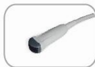
6.0 MHz Micro-Convex MC6-A