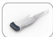
5.3-11.0MHz Linear L7S-A