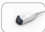
3.0 MHz Micro-Convex MC3-A