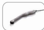
6.0 MHz Transvaginal V6-A