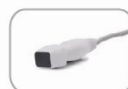
3.0 MHz Phase Array P3-A